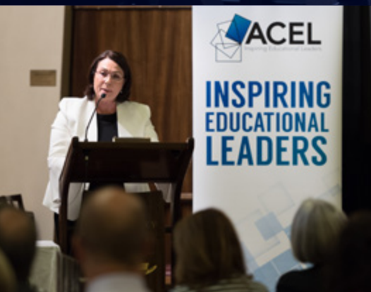
Branch Support & Initiatives