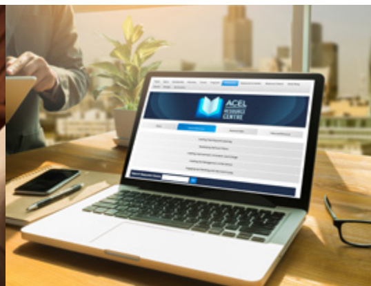
Online Digital Library