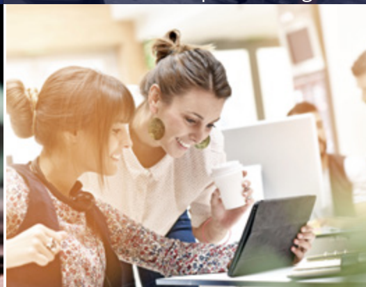
Respected Industry Publications