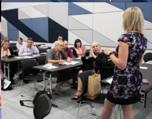
Professional Development Programs