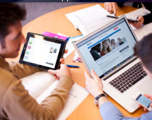
Webinars & Online Learning