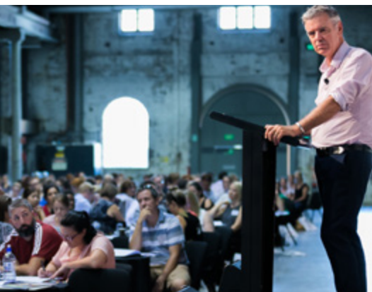
National & Local Events